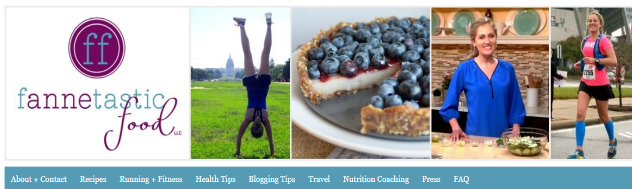
Figure 1. "7 Common Nutrition Myths"

The set of exercises is based on the blog "FANNEtastic food blog". The text chosen is "7 Common Nutrition Myths" (Figure 1) from the source: https://www.fannetasticfood.com/ .